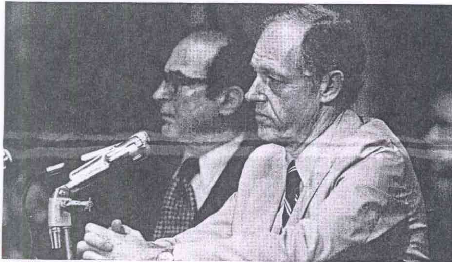
Hunt (with his attorney, Henry Goldman) testifies at the Senate Watergate Committee hearings on September 24, 1973.

Which brings us to the CIA of today, which some people question the relevance of since the end of the Cold War and the collapse of the Soviet Union. "I think it's very relevant—but for much different reasons than in the old days of the Cold War," says Hunt. "Now you have a series of rogue and renegade countries, mostly in the Middle East and parts of Africa, that pose a menace to the United States. And certainly